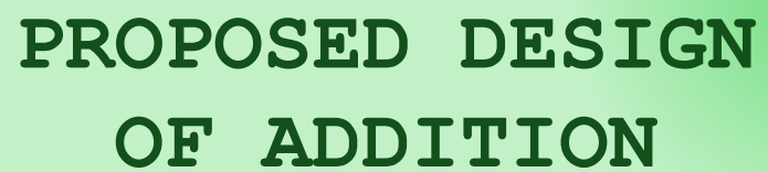
SCALE: \frac{1}{4}" = 1'-0"