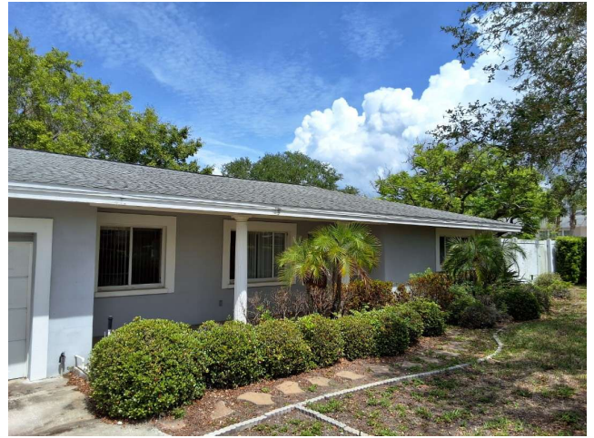
230 South Garden Circle Belleair, FL. 33756

Lot 20, Block A, EAGLES NEST GARDENS ESTATES, UNIT 3, according to the plat thereof as recorded in Plat Book 34, Pages 17 and 18, of the Public Records of Pinellas County, Florida.