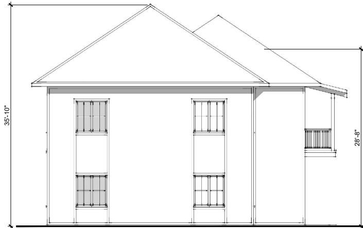
TYPICAL SIDE ELEVATION