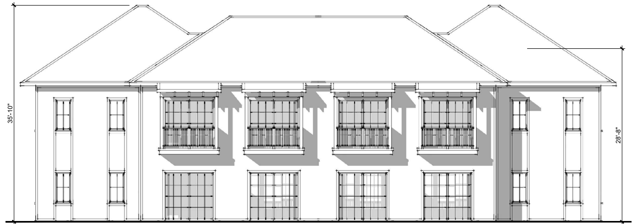
TYPICAL EAST ELEVATION