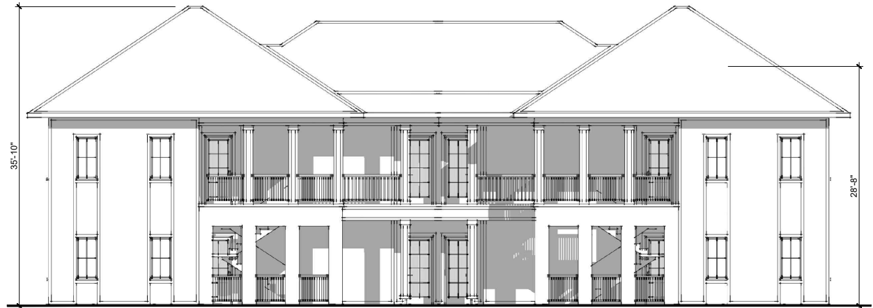
TYPICAL WEST ELEVATION