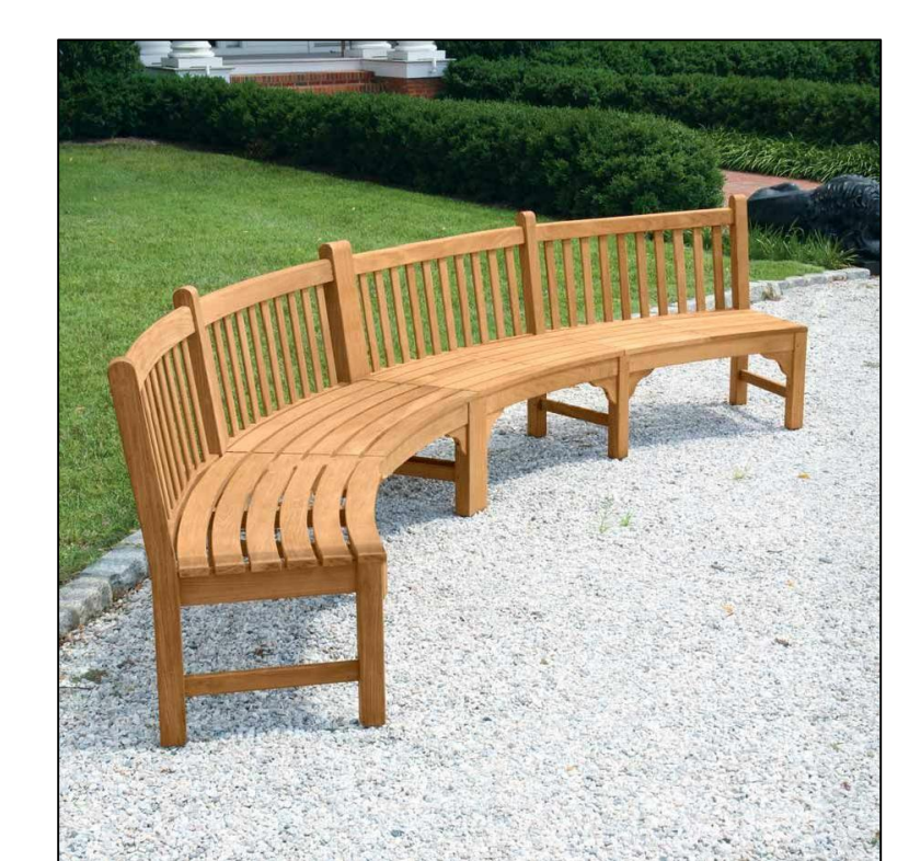
STRAIGHT BACK CURVED TEAK BENCH