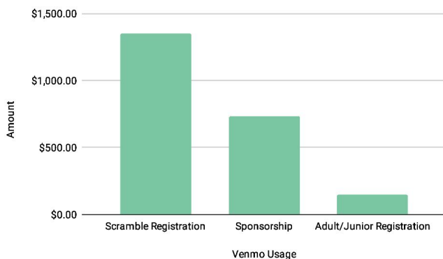
Venmo Revenue Breakdown