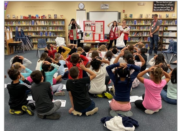
Belcher Elementary School