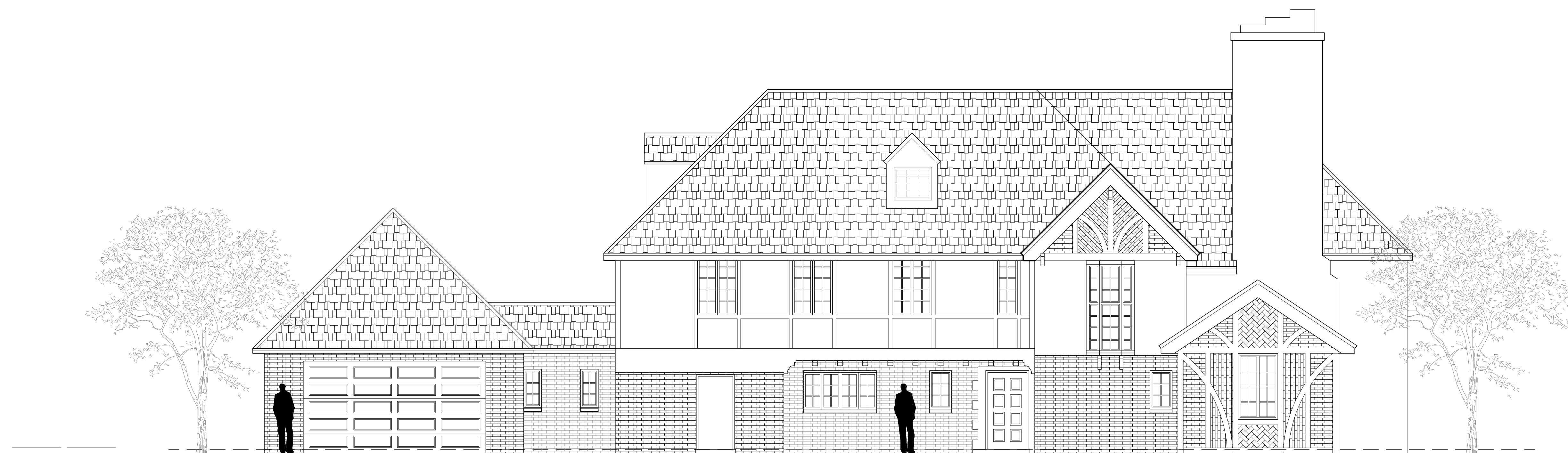
2 EXISTING FRONT ELEVATION- OPTION "B" SCALE: 3/16" = 1' WHEN PLOTTED AT 24 X 36