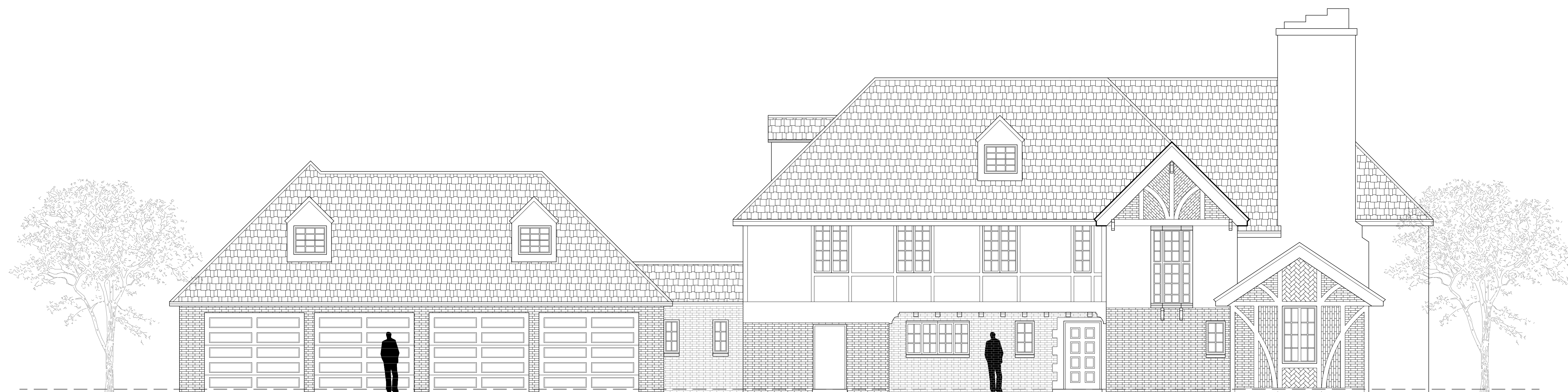
1 PROPOSED FRONT ELEVATION- OPTION "B" SCALE: 3/16" = 1' WHEN PLOTTED AT 24 X 36

STANTON RESIDENCE 305 OVERBROOK DRIVE BELLEAIR, FL 33756